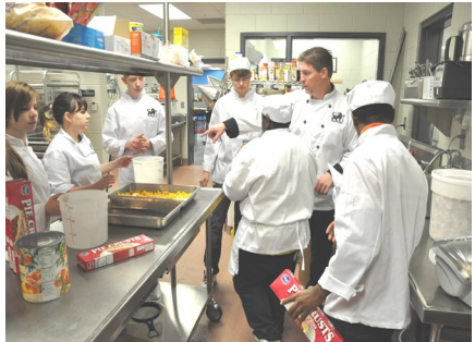
FCCLA State Leadership Conference 3/20-22 Culinary Competition @ Helms College 3/29